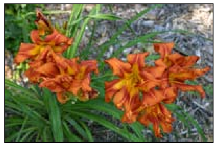
H. 'Trickster' (Tankesley-Clarke '04) drew lots of attention in the Emmerichs' Edina garden.

On the south side of the house was a bed featuring guest plants. Among them, Hemerocallis 'Trickster' (Tankesley-Clarke '04) was a 5" orange bloom with red-orange eye registered as an unusual form double; it was loaded with blooms on tour day. Next a clump of H . 'North Wind Dancer' (Schaben '01) caught my eye. It was especially lovely, featuring a