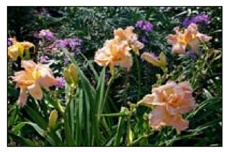
Hadeau's Turtle Rock Garden.