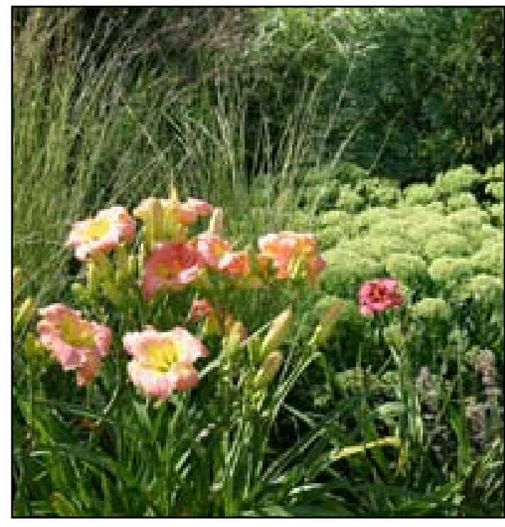
H. 'Jade Princess' (Culvar, B. '02) is complemented by Deschampsia (grass), catnip, and Sedum 'Autumn Joy'.