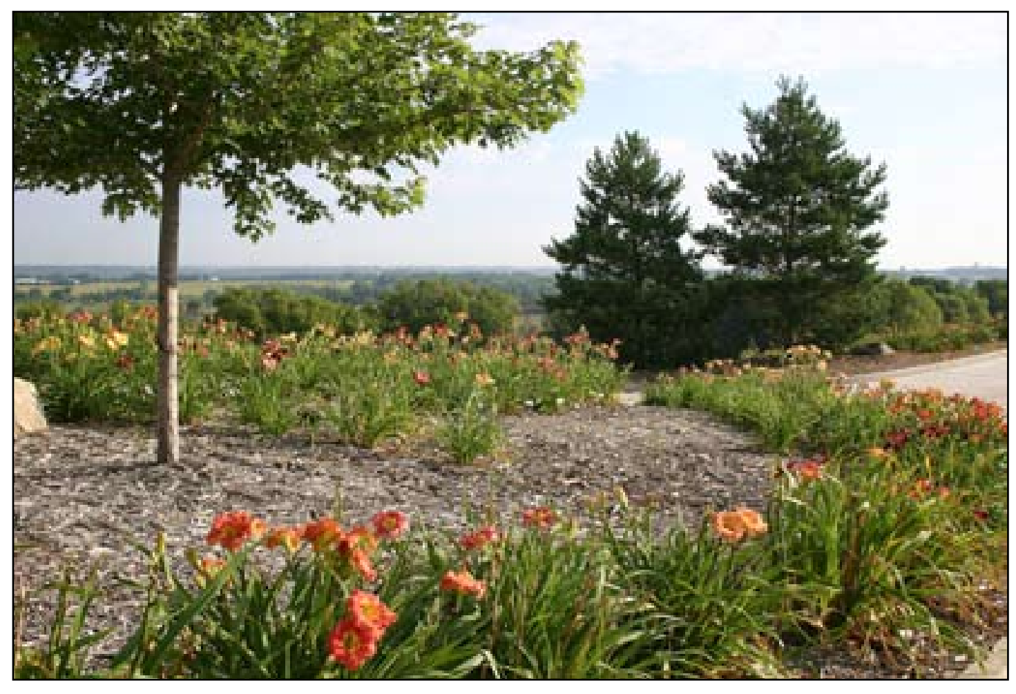
The windswept vastness of Springwood opens onto vistas that stretch for miles. The day of our tour it was gorgeous, with temperatures in the lower 80s, but I only could imagine what it might be like in January with a cold wind blowing.