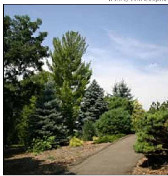
Vistas throughout the Arboretum afford lovely views of conifers and hardwoods.