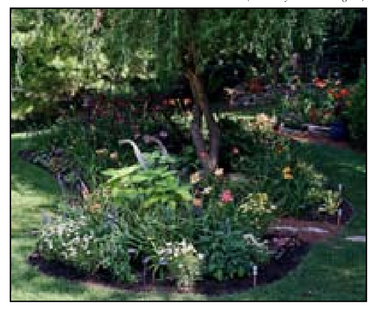
Turtle Rock Garden featured many diverse landscapes, including this lovely partial shade area, in the center of which was an impressive corkscrew willow.

a hosta tour and all the hosta beds were attractively inter-planted with impatiens, ligularia and other shade-loving perennials. After much time photographing the aforementioned areas, I finally noticed that some day-lilies grew here too!