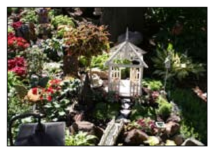
Especially photogenic was Kyle Billadeau's miniature fairy garden, comprising about a twenty foot area.