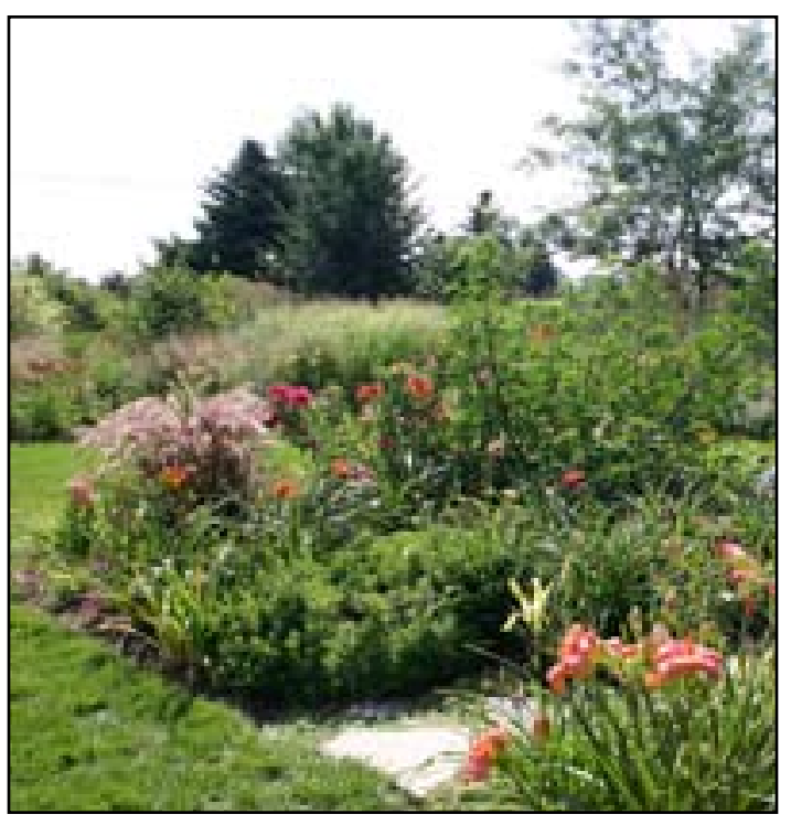
The Steve Horan Garden featured a backyard filled with daylilies and unusual companion plants, especially grasses.