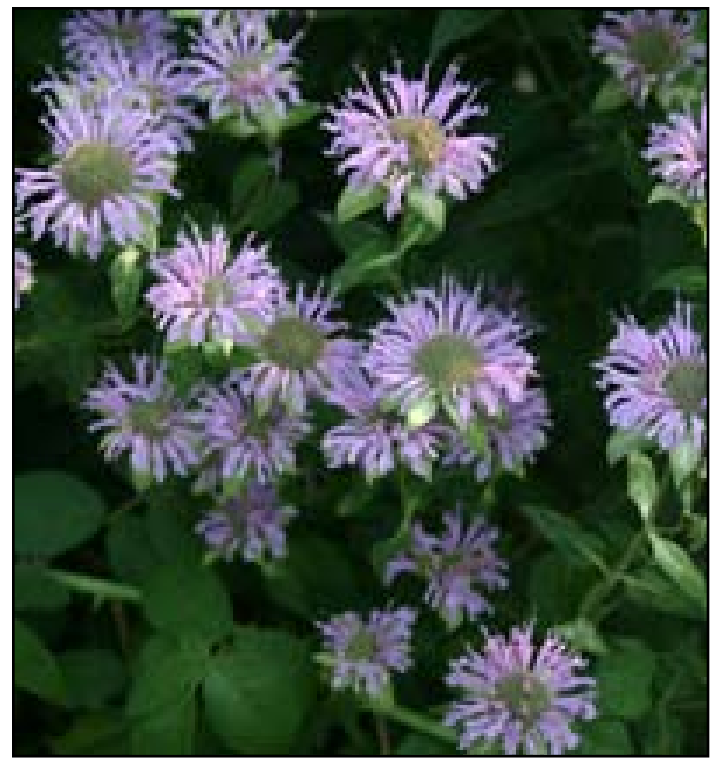
Monarda fistulosa, wild bee balm, bears lilac-purple flowers from mid-summer to early autumn.