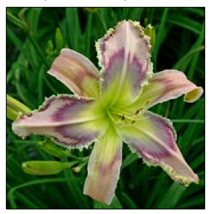
H. 'Entwined in the Vine' is an exciting departure for Karol; a toothy-edged UF, its unique patterning offers exciting new hybridizing potential.