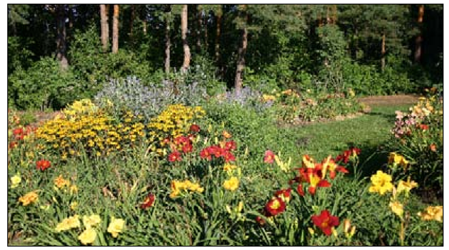
Myriads of daylilies complemented by companion plants, such as Black-eyed Susans, steely blue echinops, and blue perovskia adorn the landscape of Loon Song Gardens.