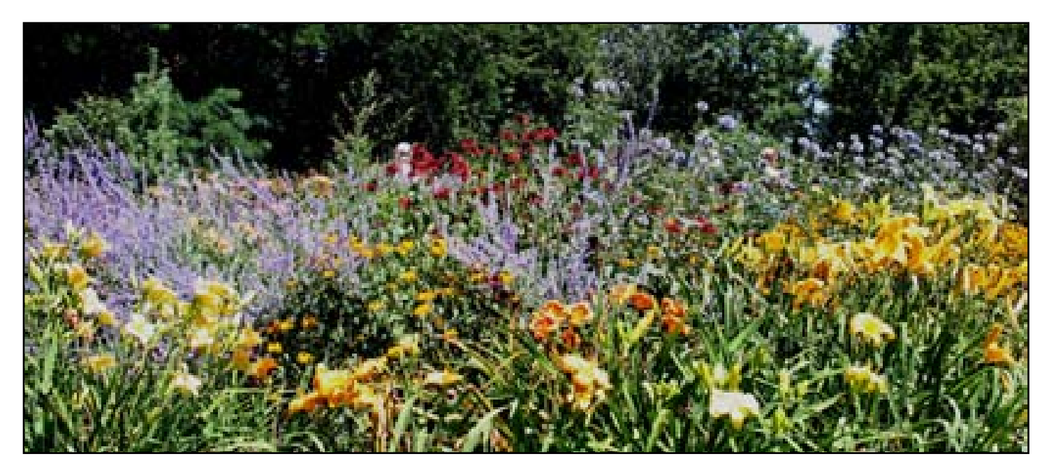
Assive clumps of blue perovskia, stately blue echinops, and red monarda provide a backdrop for the daylilies at Loon Song; the effect was like an impressionist painting.