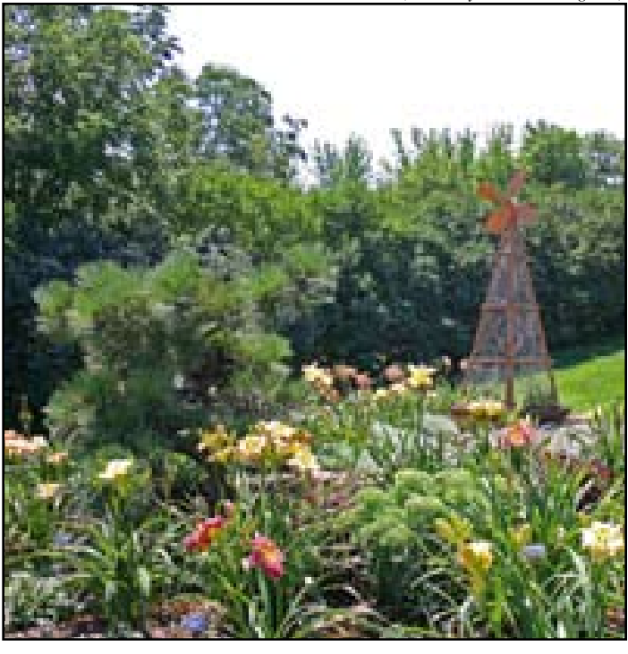
n interesting feature of the Schaben Garden is this windmill. A lush green conifer lends texture.