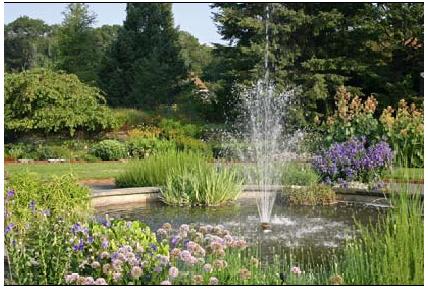
A mong the Arboretum's many water features is this pool and spraying fountain, bordered by Allium tanguticum, Lavender globe lily, in the foreground and Platycodon grandiflorus, Balloon flower, across the way.