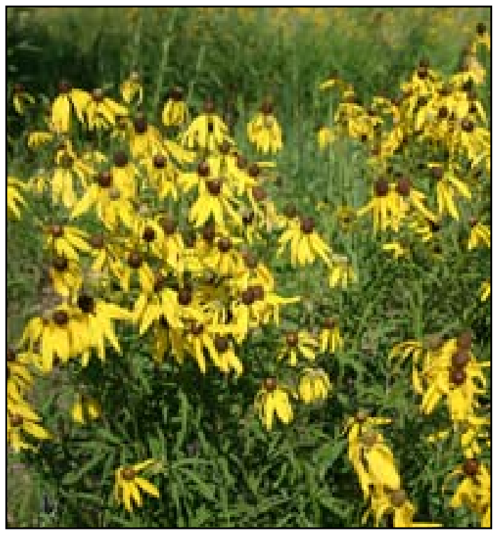
ries in the Arboretum.