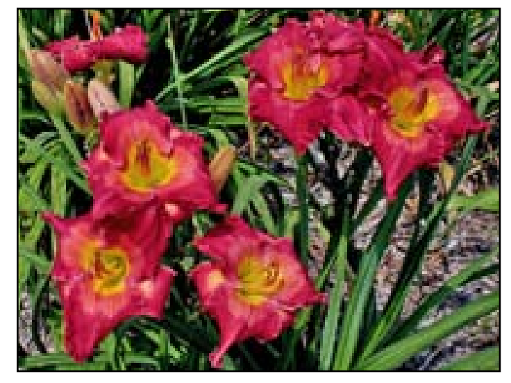
H. 'Man of Sorrows' (Emmerich '06) is another of Karol's richly colored cultivars.

and boasted a scalloped edge of rose pink and a pink band above an ivory background. Many also admired clumps of Karol's previous introductions: H . 'Blood, Sweat and Tears' ('05), a 6" bloom of clear raspberry with a lighter eye; and H . 'Man of Sorrows' ('06), a 6" bloom of deepest rose red with a lighter pink watermark.