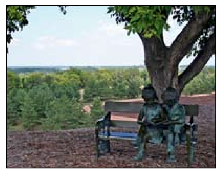
This bronze of children reading was one of many lovely bronzes at Springwood Gardens.