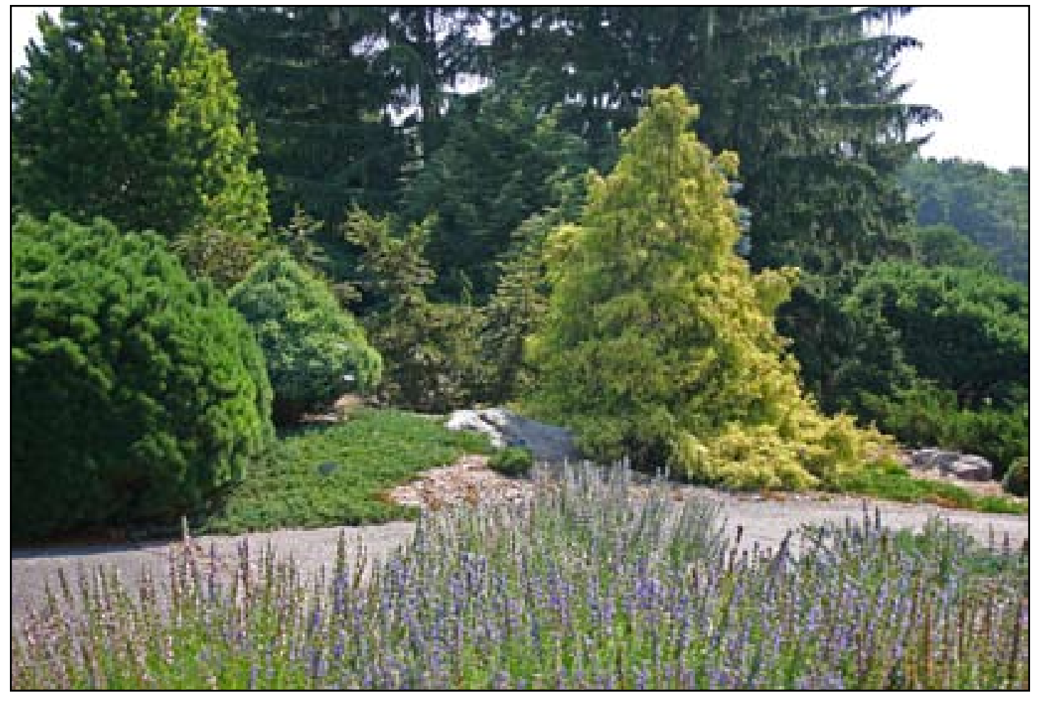
The Arboretum has several large plantings of conifers. Here amid the more formal gardens, hyssop blossoms in the foreground before an impressive specimen of Chamaecyparis pisifera 'Gold Spangle'.