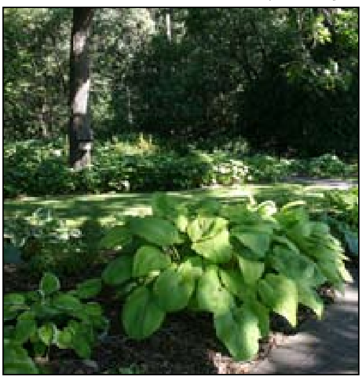
At the top of hill, a vast shaded area is landscaped with masses of hosta.