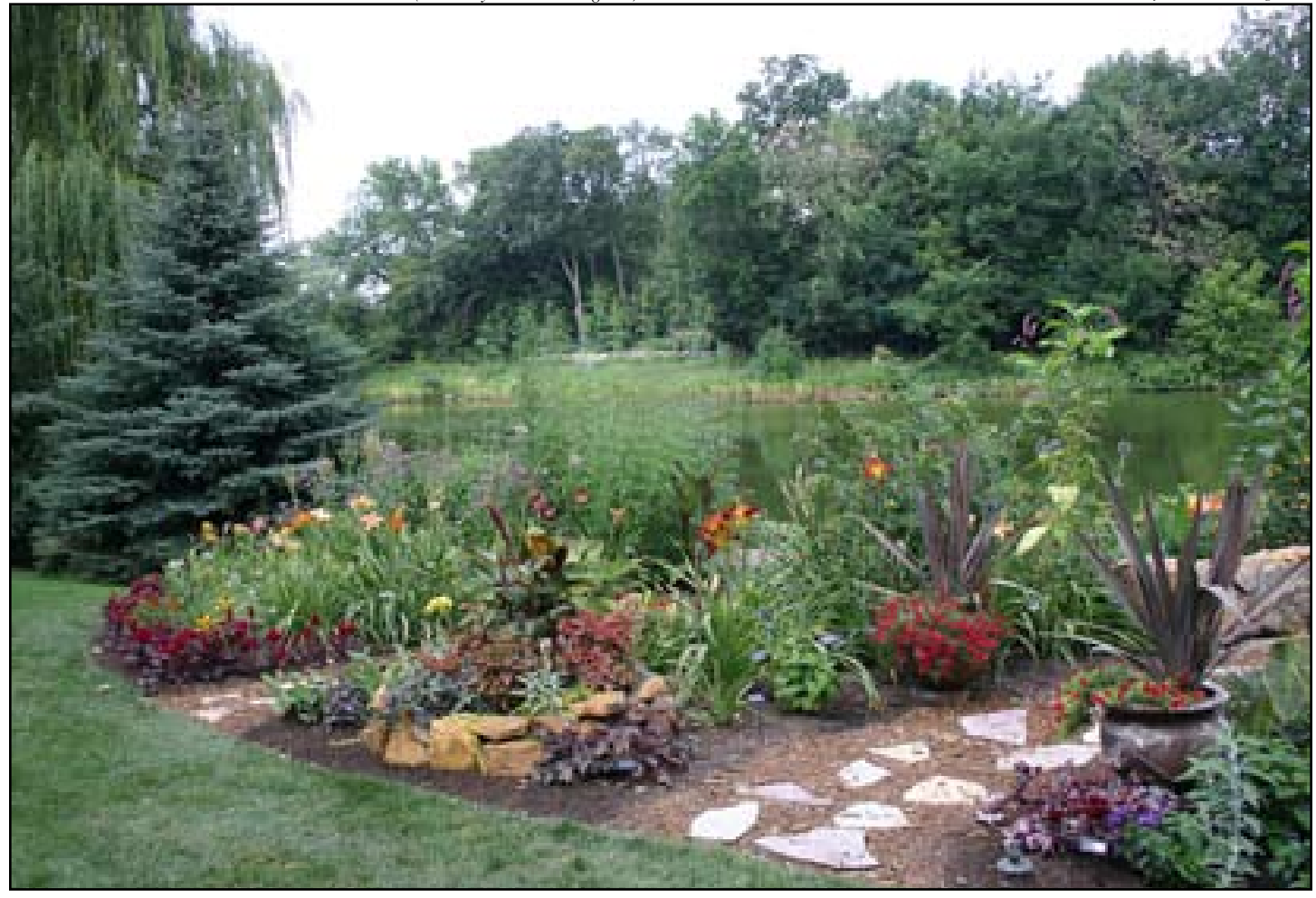
Kyle Billadeau's Turtle Rock Garden was a photographer's paradise. Poised on the edge of a lake, this lovely garden was subdvided into intriguing sections, each lovely to look at.