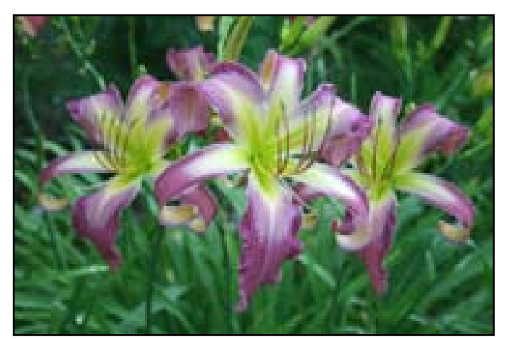
H. 'North Wind Dancer' (Schaben '01) was outstanding in a number of gardens. Here a trio of blooms is poised gracefully in the early morning light at Loon Song Gardens.