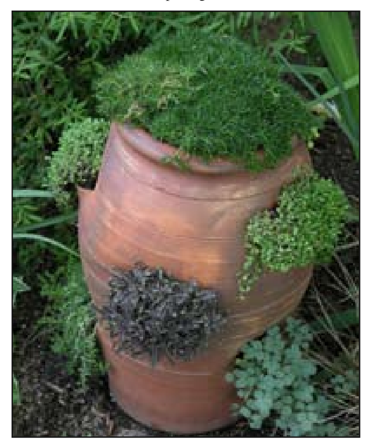
This large strawberry pot is attractively filled with herbs and mosses at Ric-A-Tee Daylily Gardens, which makes use of many attractive containers, including oil cans, buckets, and a rocker with mosaic slats.

To keep your container in peak bloom, add a complete time-release fertilizer such as 14-14-14 to the potting soil at time of planting. Soluble fertilizer is also excellent for containers, but will need to be applied every week or two when watering, if used alone, instead of slow release fertilizer. Soluble can also be used periodically to enhance the slow release for faster plant growth.