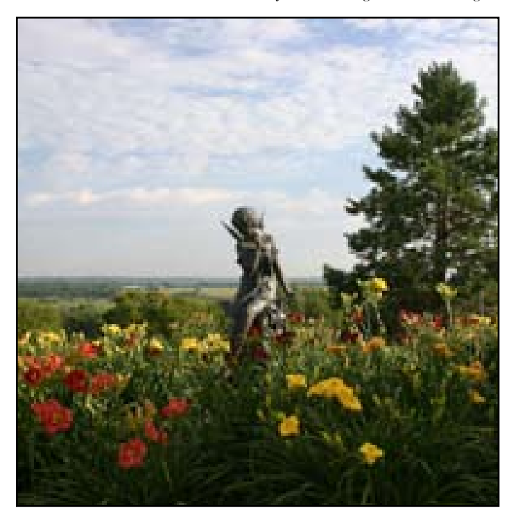
This lovely bronze angel keeps summer watch over daylilies at Springwood Gardens. The glorious rose-red seedling with deeper eye is #A289.