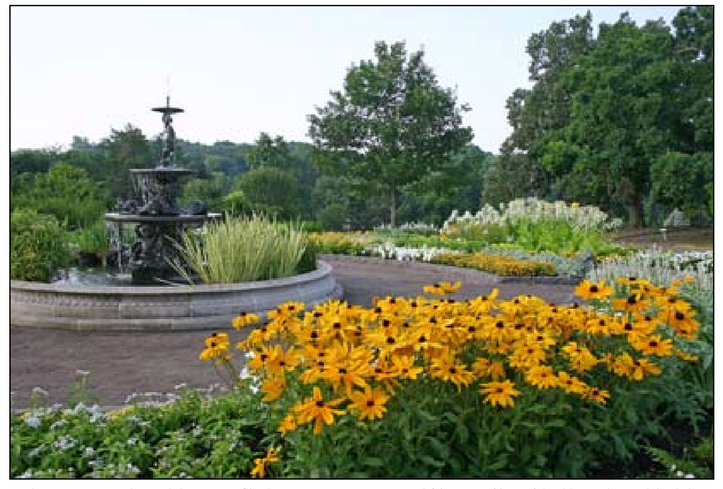
The Minnesota Landscape Arboretum in Chaska, Minnesota, encompasses 1,047 acres of beautiful public gardens, subdivided into various natural areas including woodlands and prairie. In the more formal areas, vistas such as the one above showcase plants suchs as Rudbeckia 'Indian Summer'.