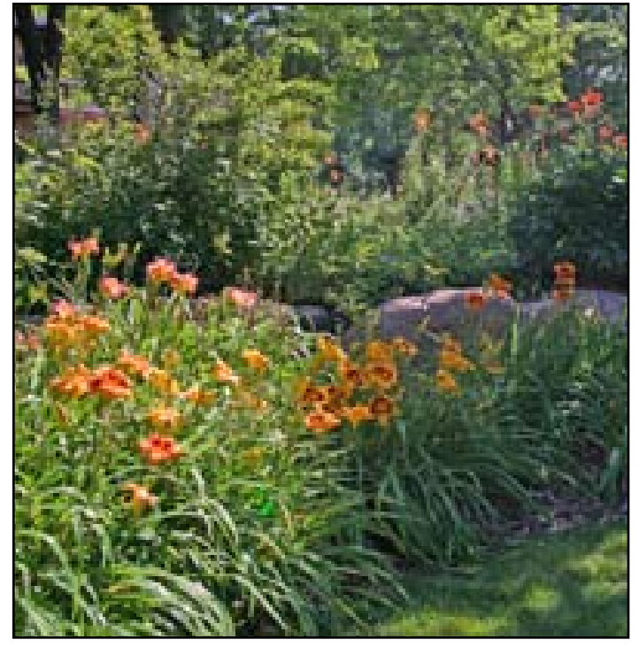
The Emmerich's Edina garden is set on a steep hill, terraced with boulders.