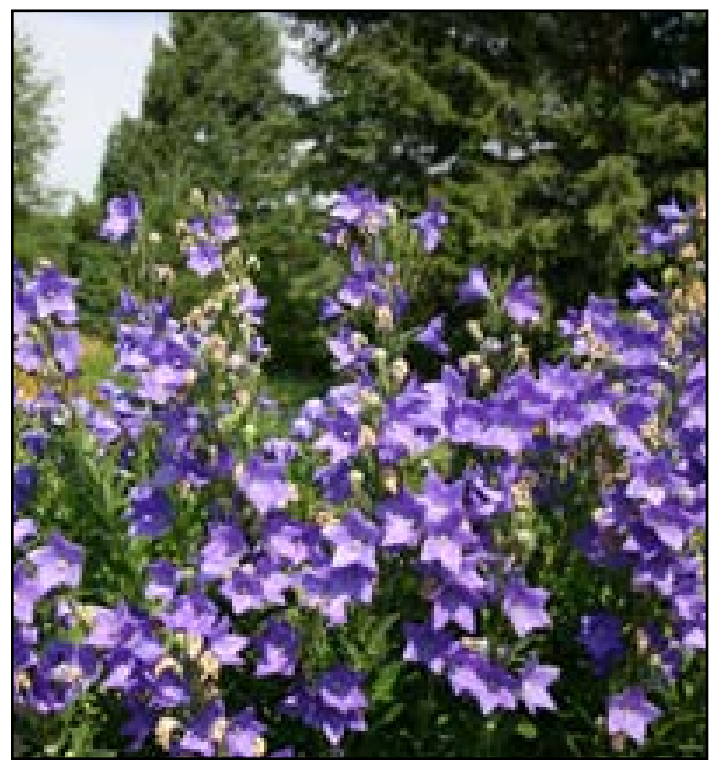
Platycodon grandiflorus, Balloon flower, glows in the pristine Minnesota light.