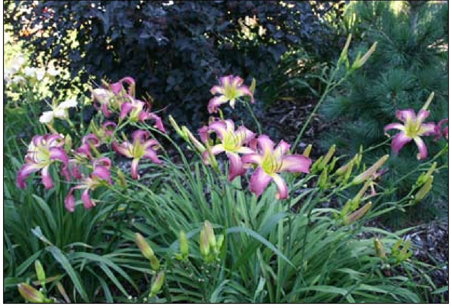
This gorgeous clump of H. 'North Wind Dancer' (Schaben '01) graced the early morning at Loon Song Gardens. A standout in a number of gardens, this lovely cultivar lends a sense of movement, wherever grown.