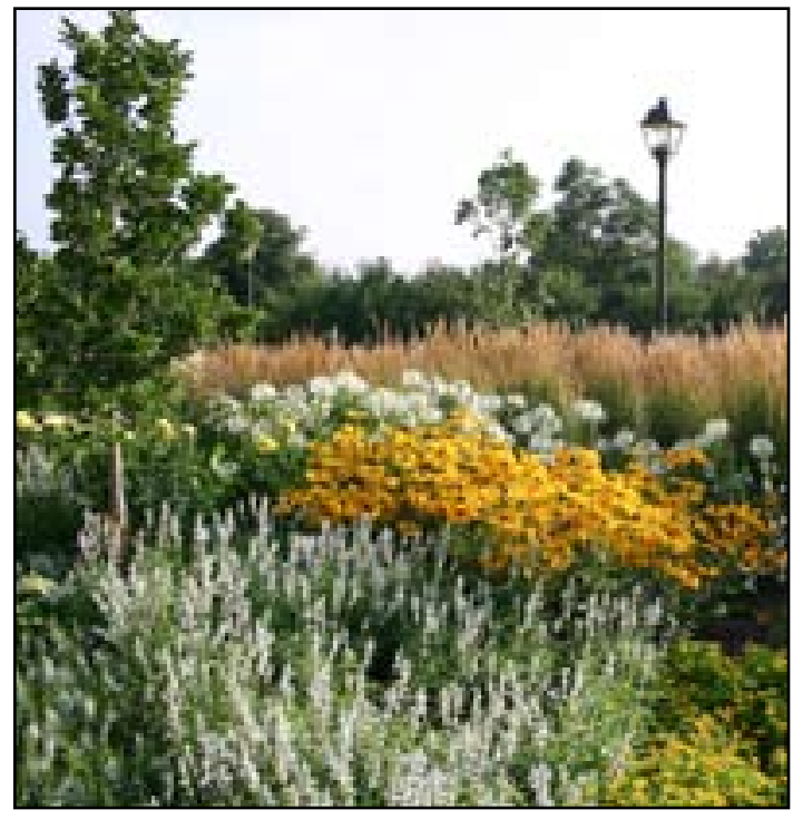
At the Arboretum's entrance, a planting of Feather grass 'Karl Foerster' greets visitors.