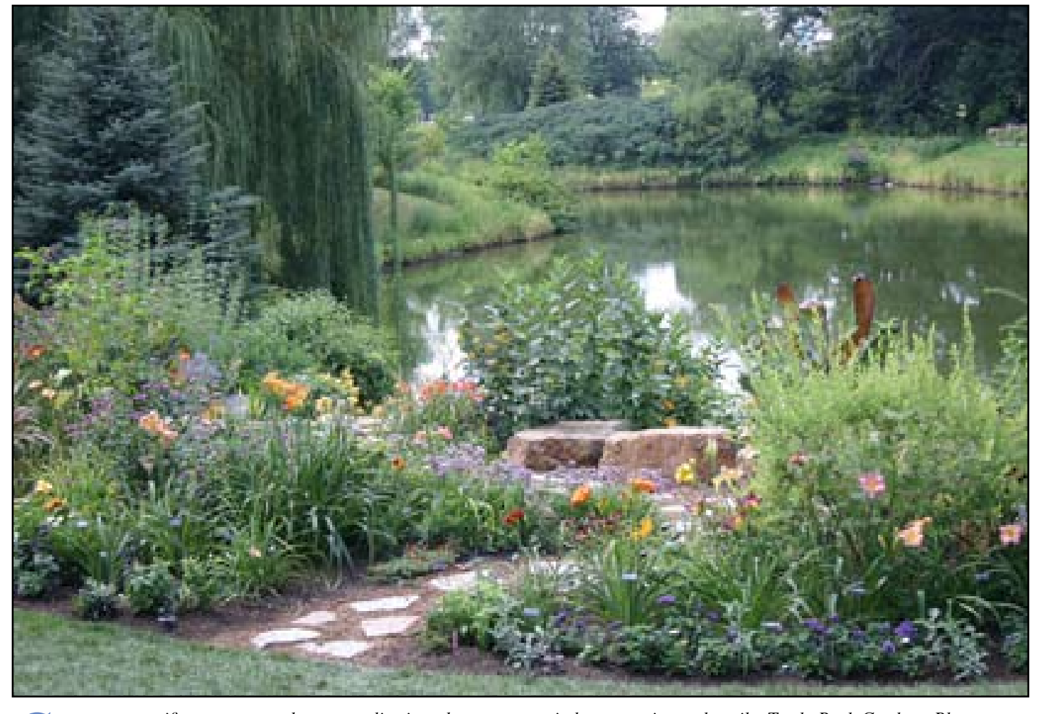
₹orgeous, magnificent, serene—these are adjectives that come to mind as one tries to describe Turtle Rock Garden. Blue spruce, \mathbf{J} weeping willows, and a lovely lake provide a backdrop for a myriad of daylilies and distinctive companion plants.