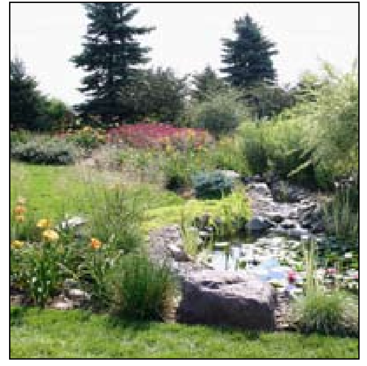
his water feature is a striking part of the Horan Garden. Bee balm graces the distance.